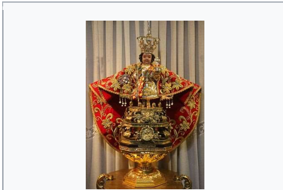
Image of Señor Santo Niño de Cebu

The Santo Niño de Cebú ( Cebuano : Balaang Bata sa Sugbo, Filipino : Batang Banal ng Cebu, Spanish : Santo Niño de Cebú) is a Roman Catholic title of the Child Jesus based on a religious relic icon in Cebu City of the Philippines . [1] The image is venerated as miraculous by many Filipino Catholics . [2][3] It is one of the oldest Christian relics in the Philippines, [4] originally given in 1521 as a gift by explorer Ferdinand Magellan to Rajah Humabon and his wife when he landed on the island. [5]