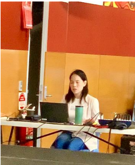
The always ready-to-assist Music Ministry.