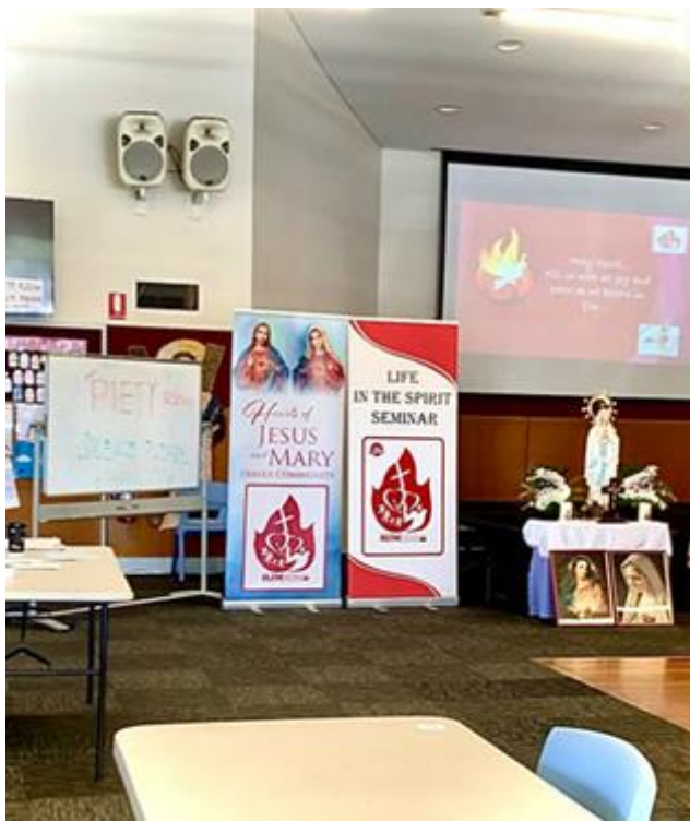
The members of the Service Ministry in action.

The members of the Prayers and Intercessory Ministry dedicated prayers for the candidates in the Piety room.