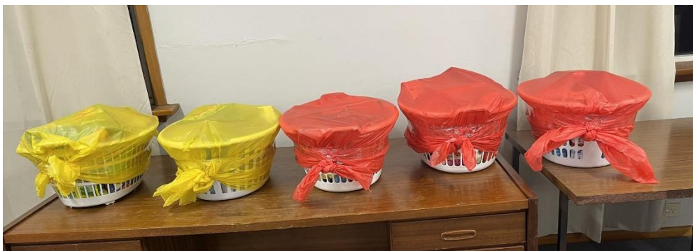
A big Thank You to all HJM members. 5 baskets of goodies for the Offertory.