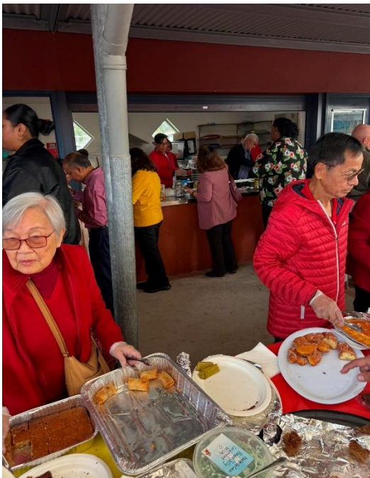
The Service Ministry at full steam.