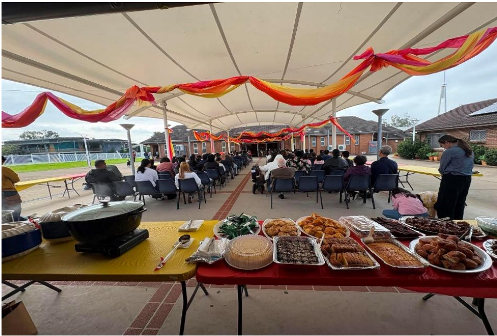
The piazza has also been decorated. Lots of food to share.