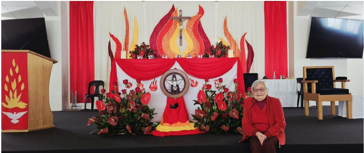
The altar is beautifully decorated.