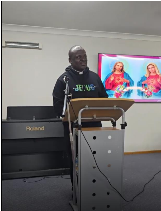
Members visiting the sick and the elderly – June 2, 2026.