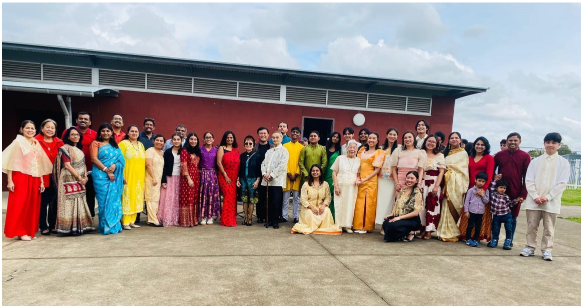
Some parishioners came in their cultural costumes.